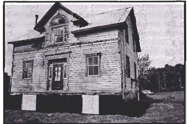
The Fairbairn House (ca 1993), HSG 002209-007

This homestead was built in the late 1860s to replace the first house which was constructed of logs and situated closer to the river. The house and farmland was passed to the Stevenson family and later the McNally family who farmed the property until 1989.