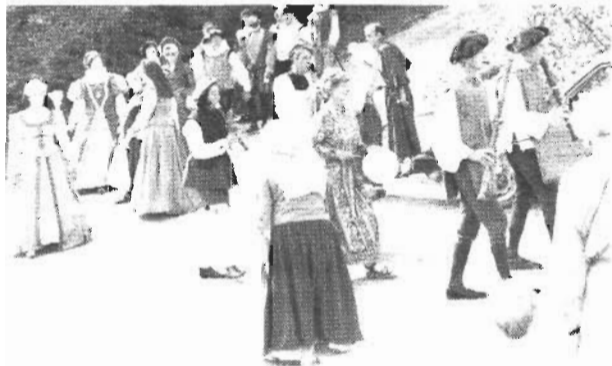
La grande Elizabeth 1 re fait son entrée triomphale à Wakefield.