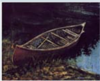
Chestnut Prospector Canoe by Bill Mason

Monday, October 15 at the Chelsea Library at 7:30 pm Old Chelsea Rd., Chelsea QC