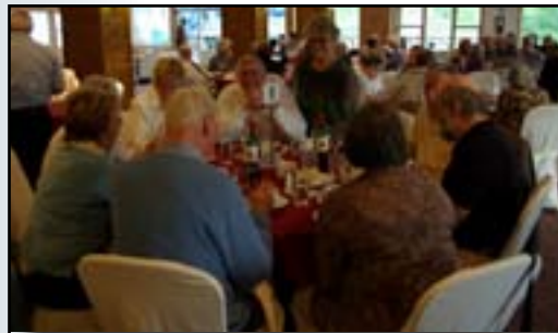
Members enjoying the evening's activities.