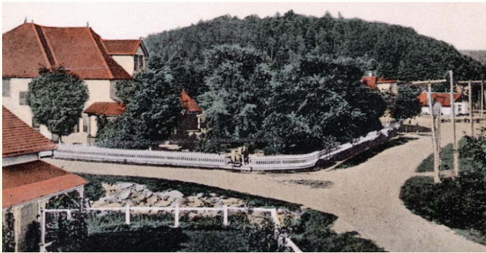
Postcard of "Upper Town", Wakefield [ca.1910]

For nearly fifty years the Society has been collecting and preserving original books, photos, maps, recordings, and digital images. Since securing permanent space in the Chelsea Library our collections have been growing and have become one of the Society's most important resources, supporting the Society's mission to make known and preserve the history and heritage of the Gatineau Valley.