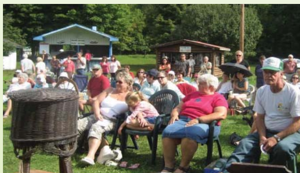
some of the bidders